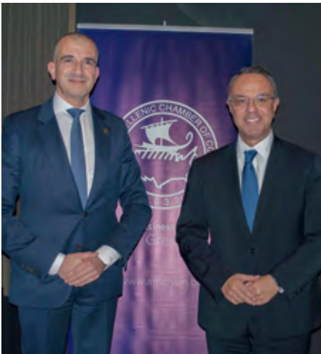
VASSILIS KAFATOS, CHRISTOS STAIKOURAS

On December 19, 2023, the American-Hellenic Chamber of Commerce held a closed working luncheon with Minister of Infrastructure and Transport Christos Staikouras. During the luncheon, which took place at the MET Hotel in Thessaloniki, Minister Staikouras discussed the crucial role of appropriate infrastructure and its significance for business as well as the everyday life of the country's citizens. The minister further outlined the government's priorities in this regard in the coming period and took the time to answer questions posed by the Chamber members and distinguished business leaders attending the luncheon.